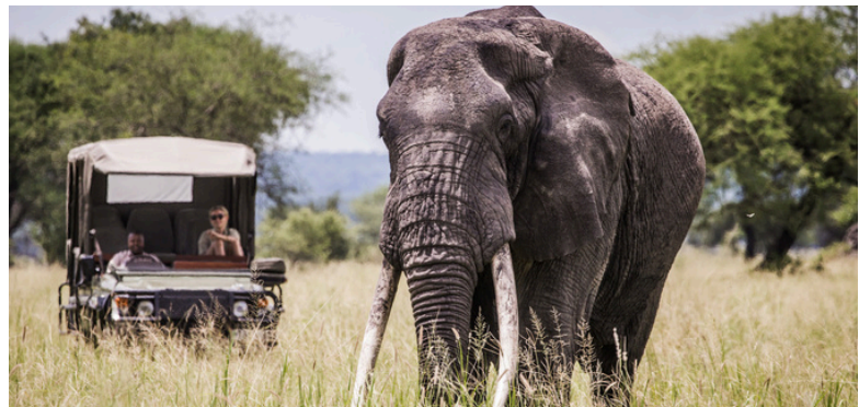
Big Tusker Encounters