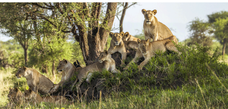
Resident Lion Prides