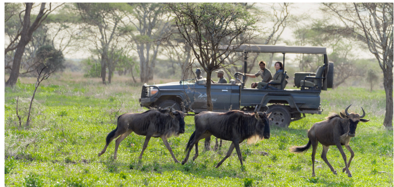
Private Guide & Vehicle