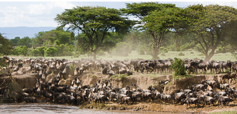
The Great Migration