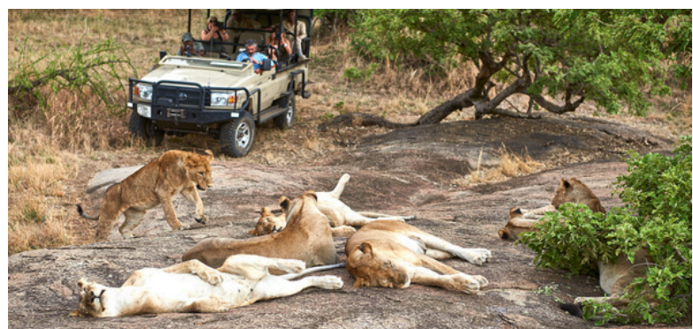
Exclusive-Use Wildlife Areas