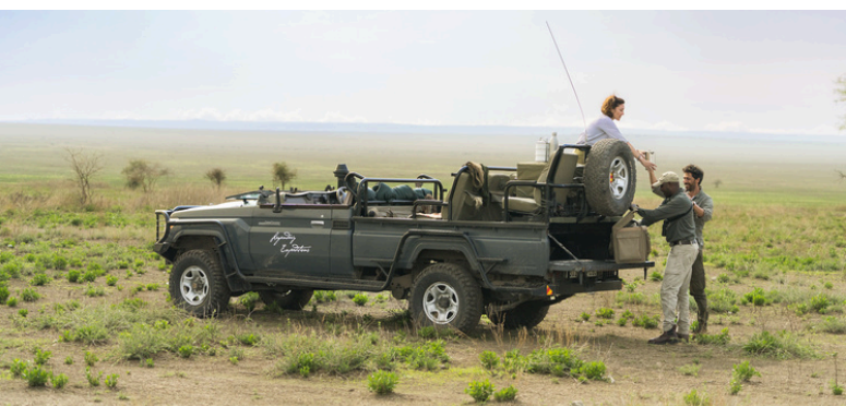
Private Guide & Vehicle